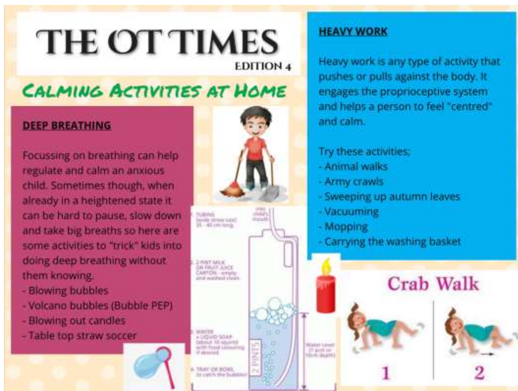
Brittany Curtain Occupational Therapist

Please note that modified arrangements for End of the School Day Pick – Up will continue in Term 2. With the construction of the new School Building beginning over the school holidays approximately 20 staff car parks have been lost and will require some staff to park on Fortune Street until our temporary car park is constructed.