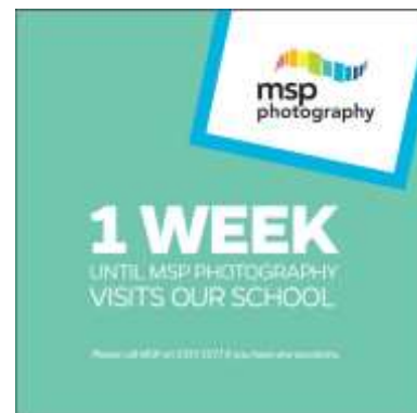
Photo day is Monday 28 th February and children will be required to be in full summer uniform (not sport uniform).

Last Monday you received your child's personalized photo envelope from MSP Photography. If you wish to purchase photos please ensure your child has the photo envelope on photo day with the correct money or alternatively there will an option to order photos online. Family Photo envelopes will be available from the Office.