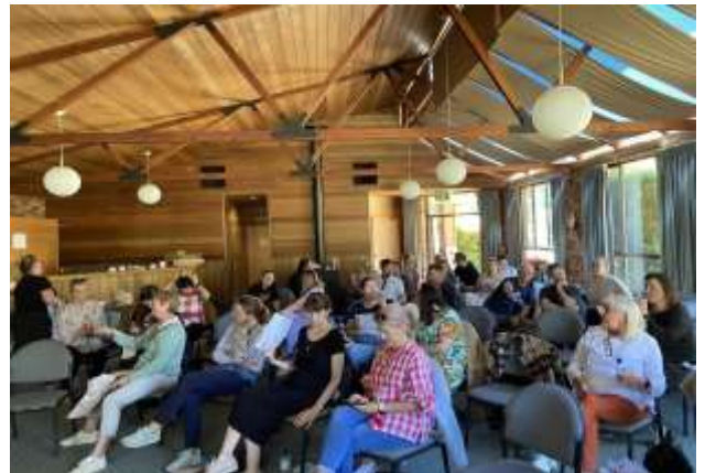
The staff get ready for the next session.