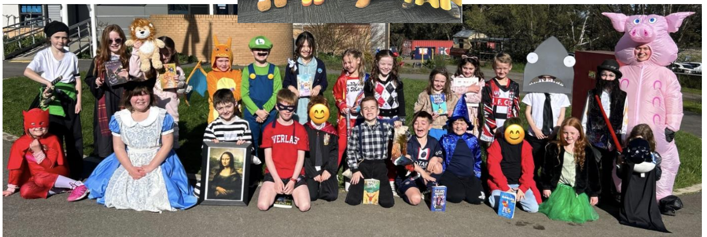
St. Francis Xavier Primary School is a Child Safe School called to action through Gospel values and Mercy tradition. Through the mission of Jesus within the Mercy tradition, we are called to action in pursuing fullness of life for all.